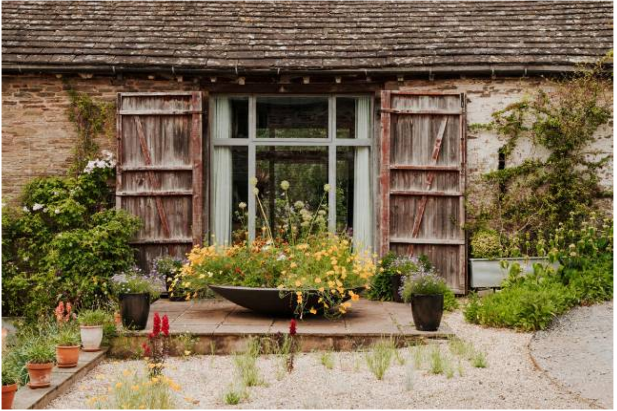
21 of 40223187 - MH.hr-77.jpg