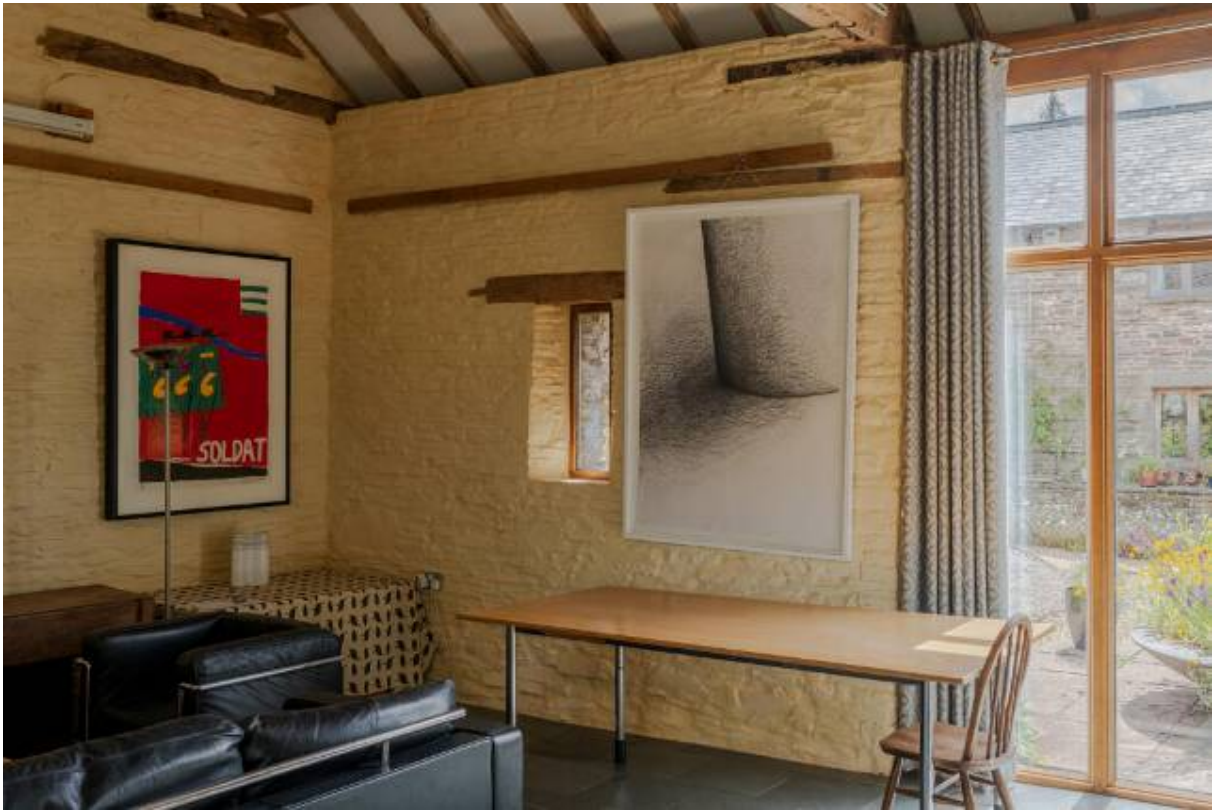
23 of 40223113 - MH.hr-5.jpg