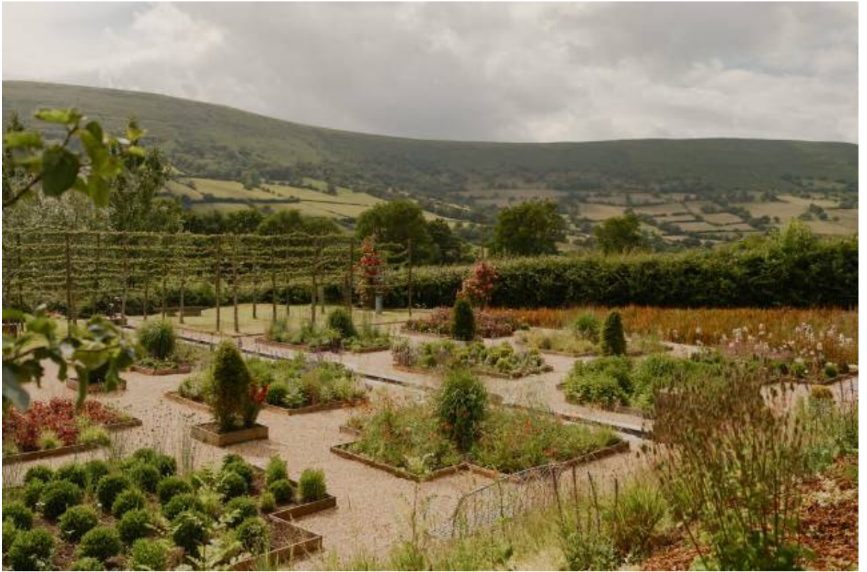
7 of 40223194 - MH.hr-84.jpg