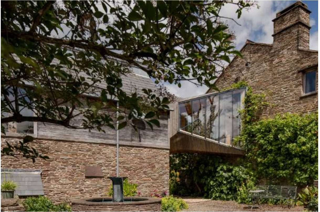
4 of 40223144 - MH.hr-36.jpg