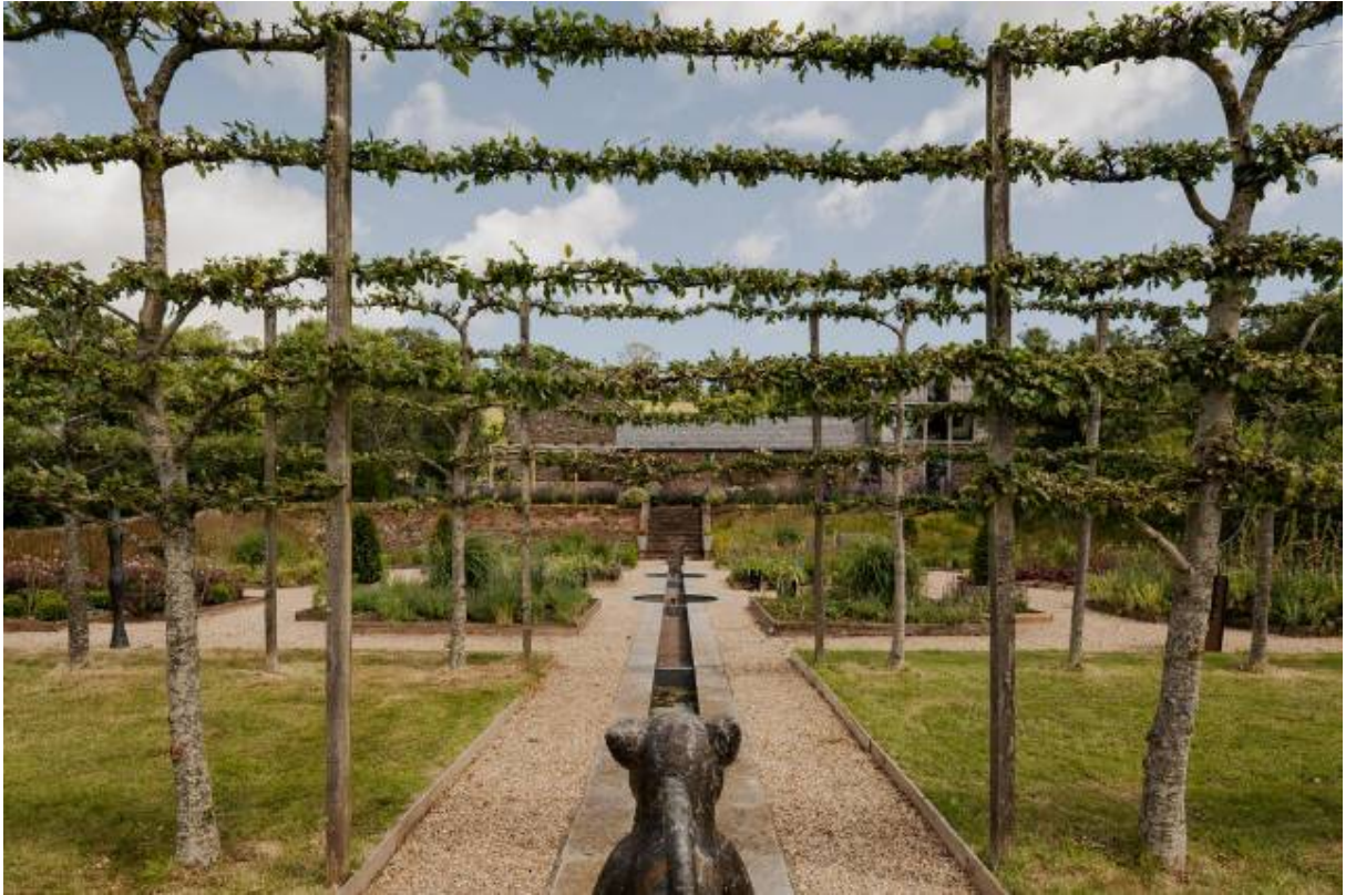
28 of 40223145 - MH.hr-37.jpg