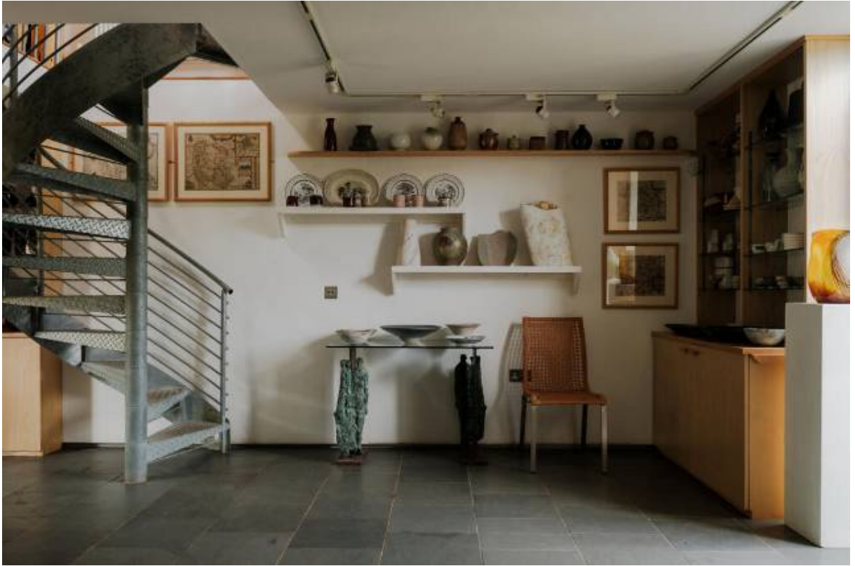
19 of 40223164 - MH.hr-54.jpg