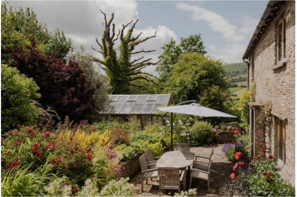
29 of 40223142 - MH.hr-34.jpg