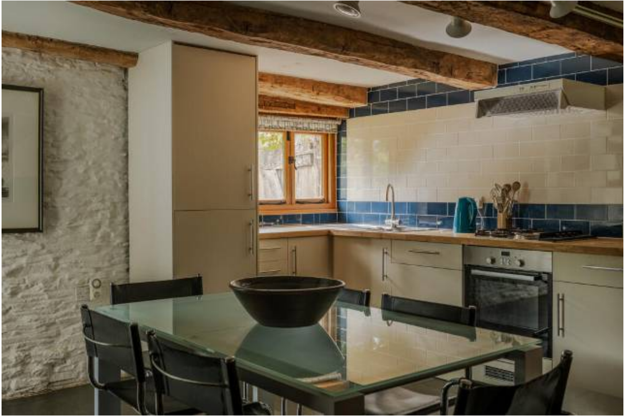
24 of 40223118 - MH.hr-10.jpg