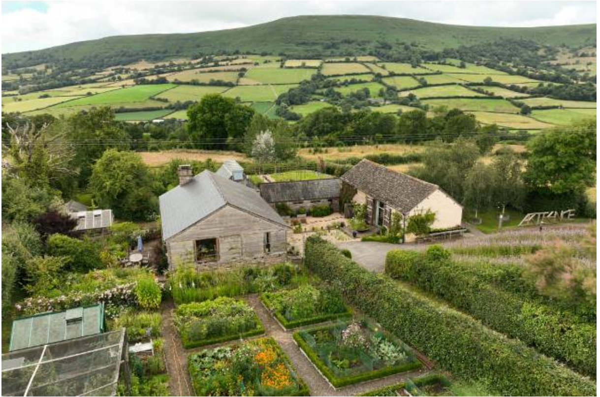
38 of 40225518 - A000X00000APKGHUA2_N114-graded.jpg