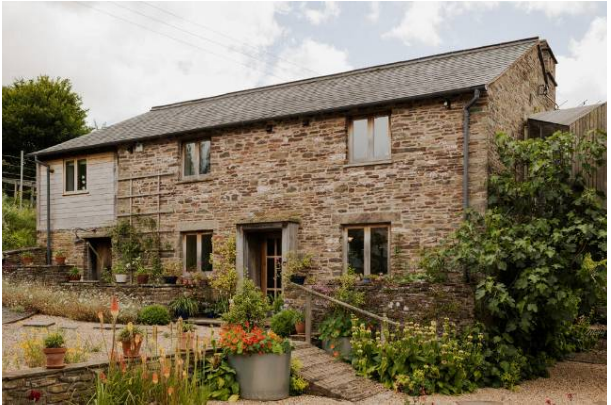
10 of 40223119 - MH.hr-11.jpg