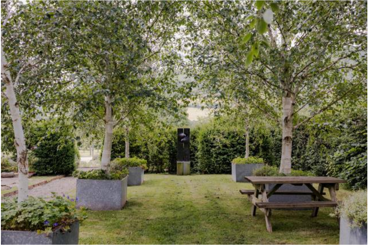
32 of 40223124 - MH.hr-16.jpg