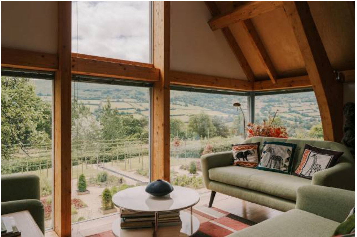
18 of 40223159 - MH.hr-51.jpg