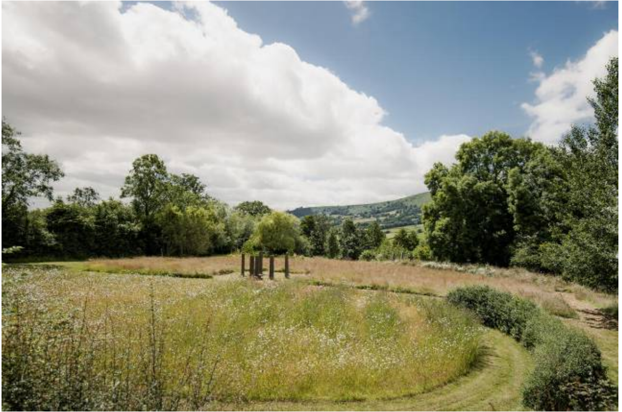
35 of 40223147 - MH.hr-39.jpg