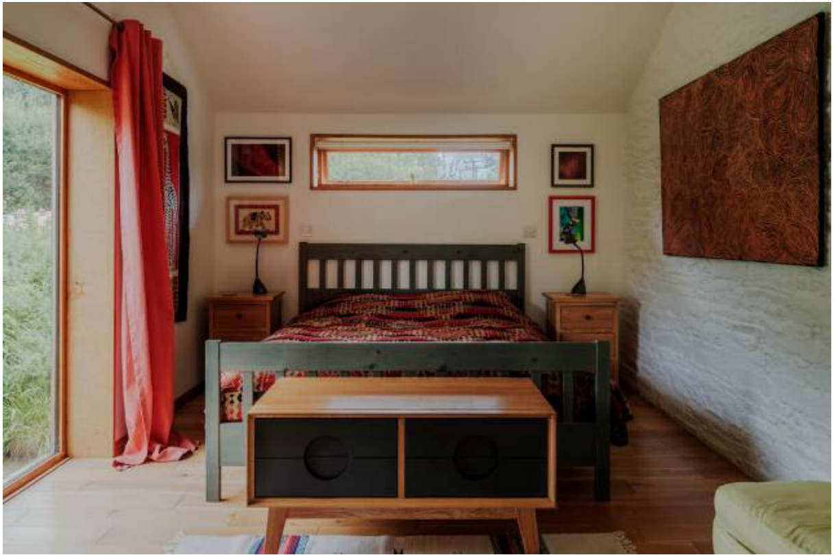
14 of 40223175 - MH.hr-65.jpg