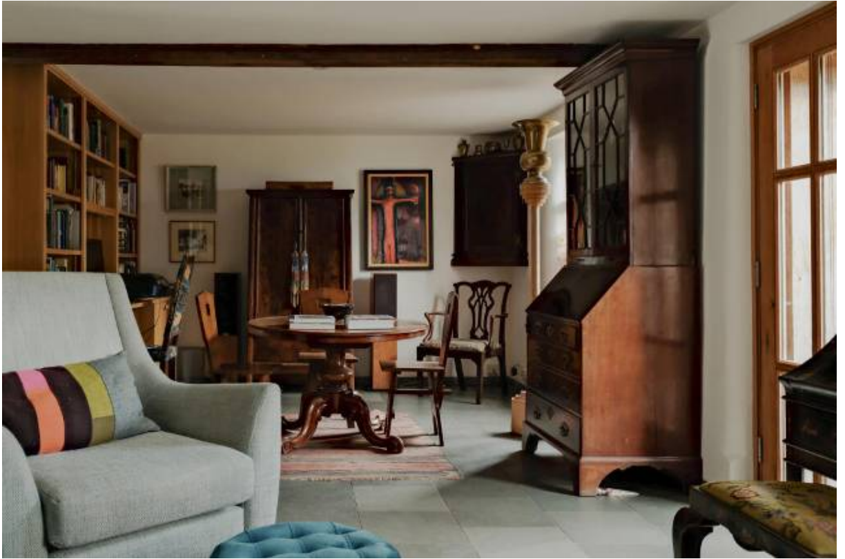
11 of 40223156 - MH.hr-48.jpg