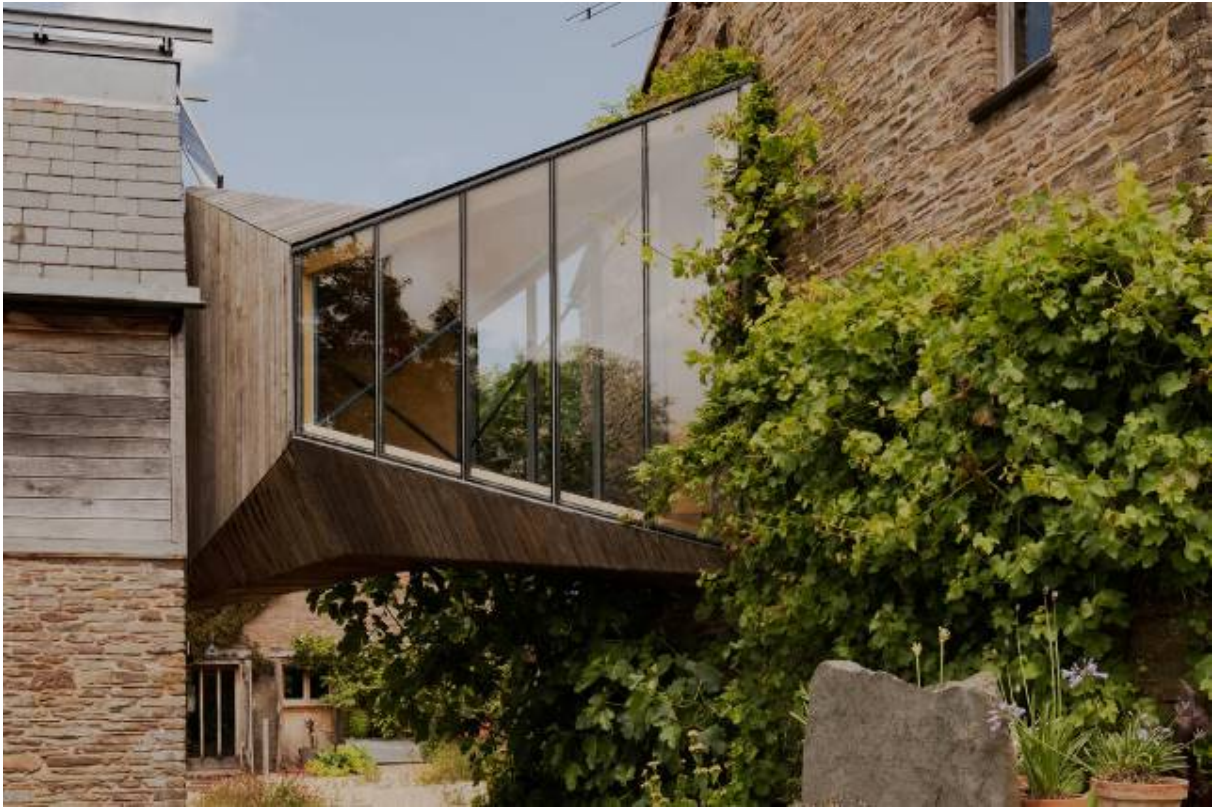
16 of 40223140 - MH.hr-32.jpg