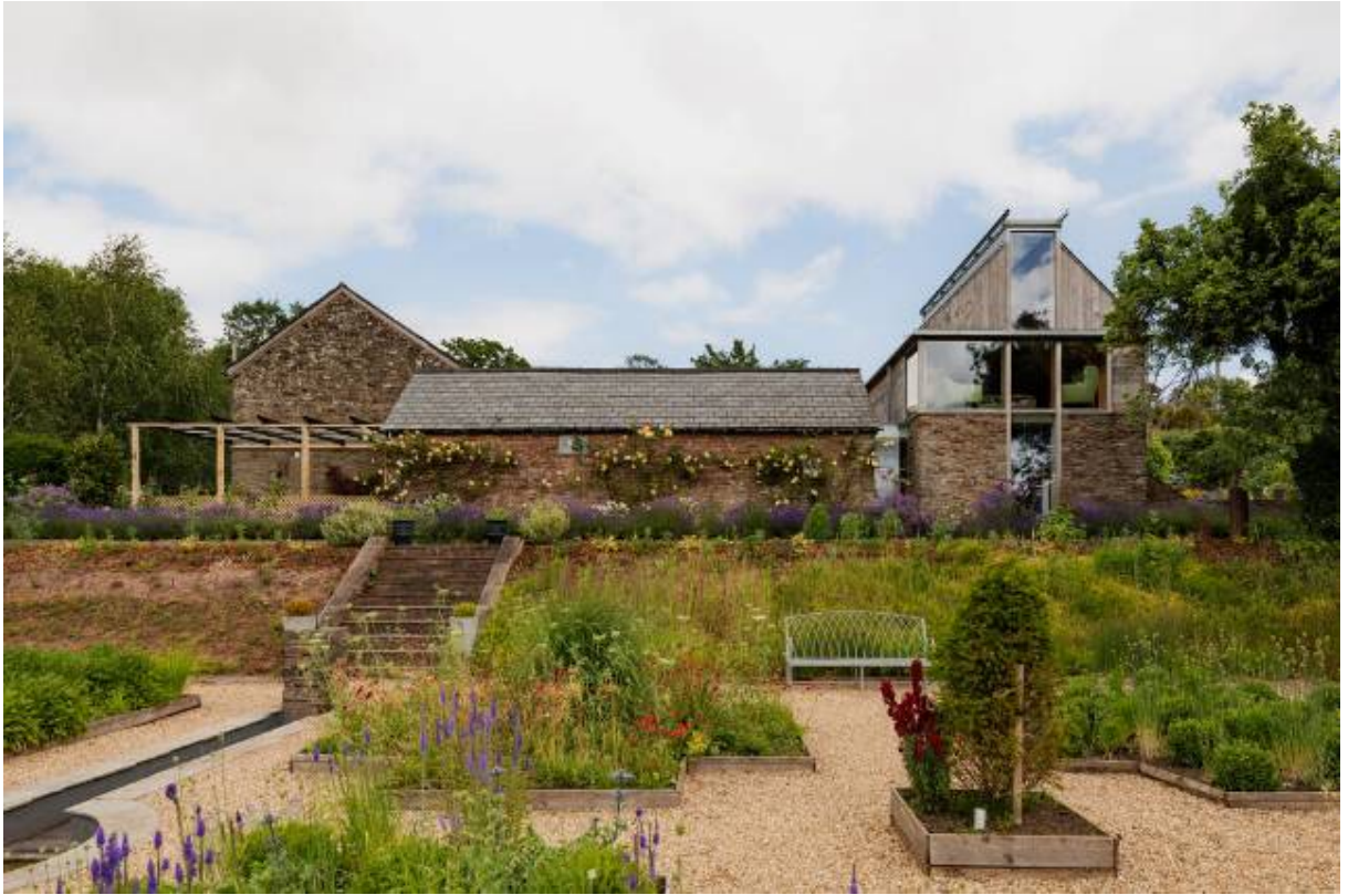
1 of 40223153 - MH.hr-45.jpg