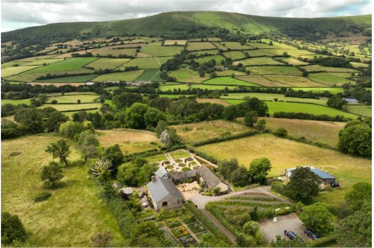
8 of 40225517 - A000X00000APKGHUA2_N102-graded.jpg