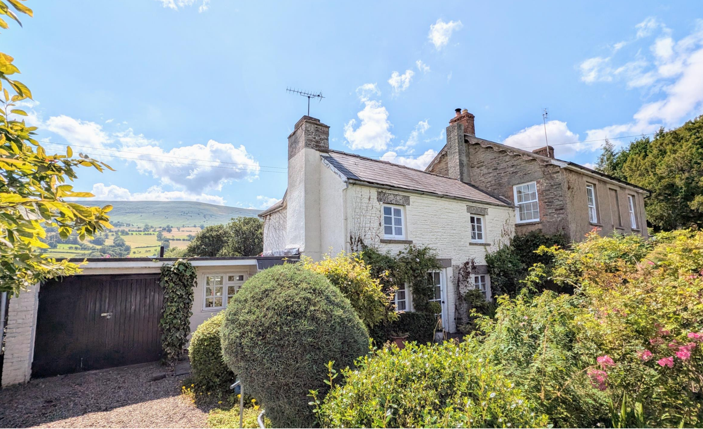
Rose Cottage, Longtown, Herefordshire HR2 0LD